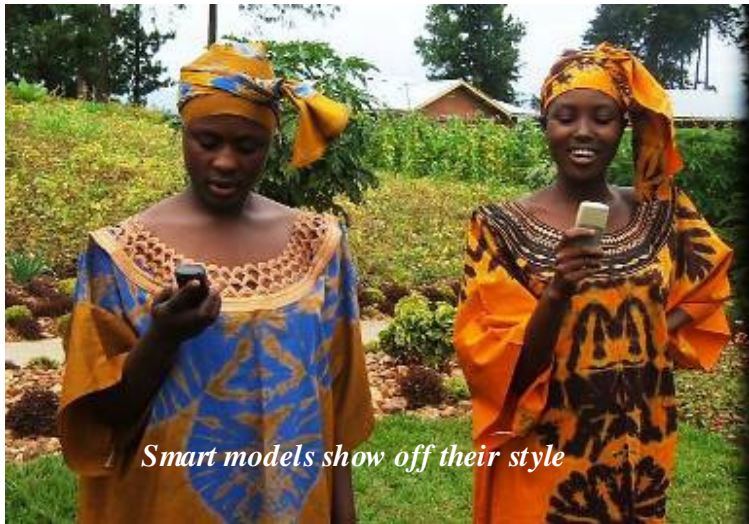
Smart models show off their style