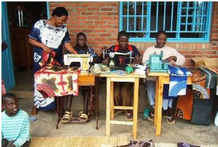
Expert Tailors design the garment under supervision