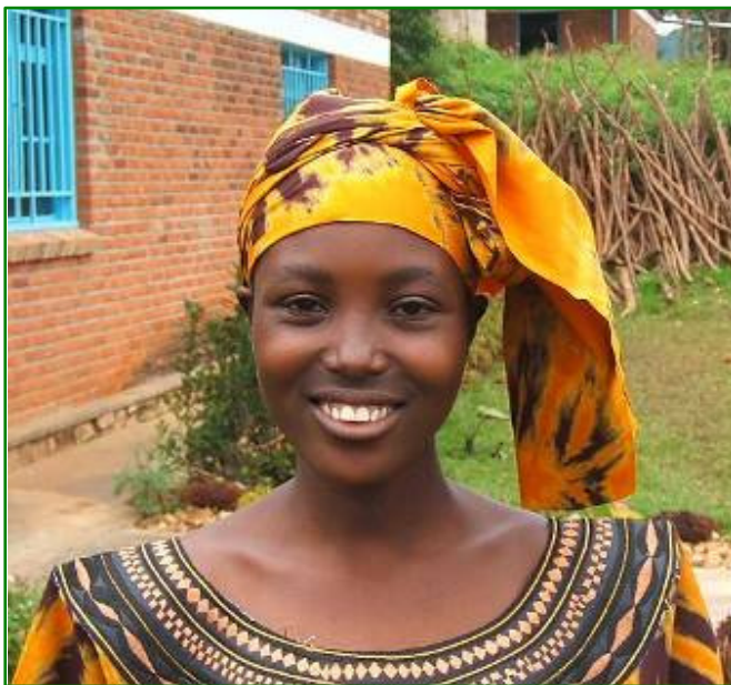
Komera Models in the making, God is our helper.