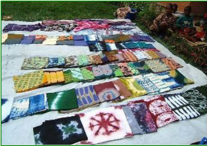
Some of the Batiks already made awaiting marketing