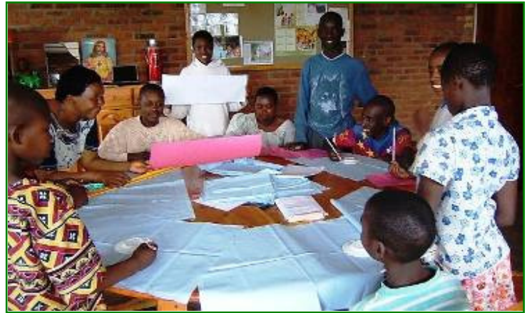
Batik Class in session