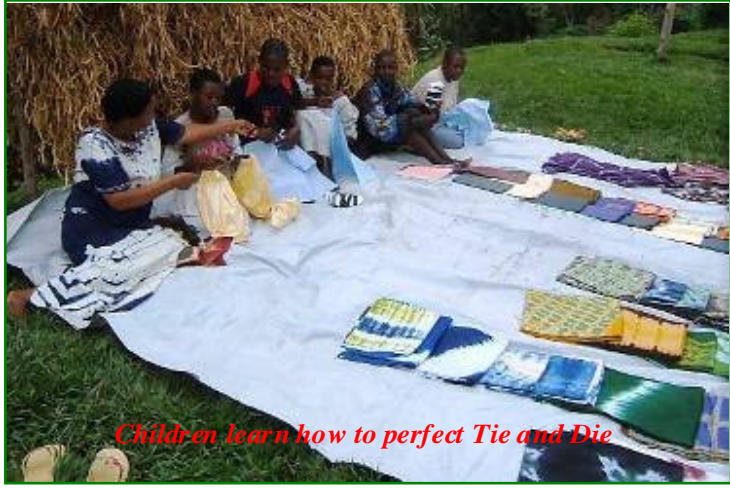
Children learn how to perfect Tie and Die